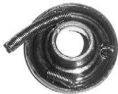
Photo at left shows excessive spring wear resulting in breakage of spring and bearing after only 40,000 miles into second service life of part.

When a valve rotator quits rotating due to extreme wear or breakage of the internal spring, Valves will of course not rotate as they are designed to do. This can ultimately result in valve burning, guttering and breakage. Cylinder component damage such as piston to valve contact and possibly catastrophic failure is possible.