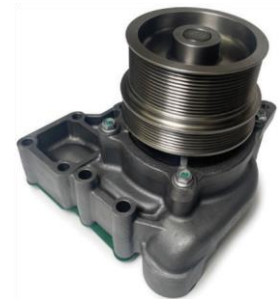
5406048 - Cummins X15 / ISX15 Water Pump