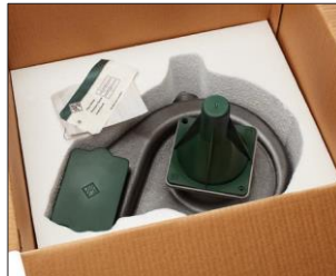
Protective cone and cap keeps debris out