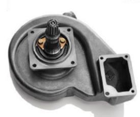
4160609 - Cat 3500 Water Pump