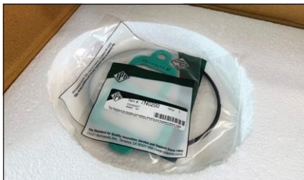
Each pump comes with a seal kit (gasket and o-rings) to help with your installation.

Buy new or rebuild – now you can purchase the water pump parts you need to rebuild your IPD water pump and make it function just like it's brand new. The following IPD manufactured water pumps and repair kits are available. Every repair kit comes in innovative IPD packaging that keeps it free from dings, damage and dirt with the parts carefully labeled. Inside you will find an impeller, shaft, seal assembly, non-threaded plug, steel retainer, tapered rolling bearing, filter and screw made from quality materials and designed to perform for demanding applications.