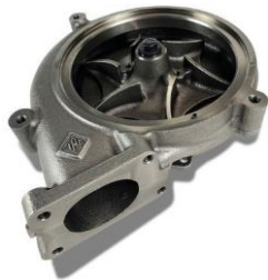
3520200 - 3412/C27/C32 Water Pump