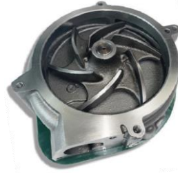
3362213 - C15 Acert / C18 Water Pump