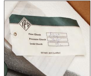
The signed tag proves every pump is personally inspected for leakage, pressure and flow