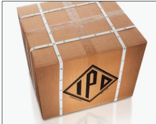
Strong banding around each box means your pump arrives in perfect condition