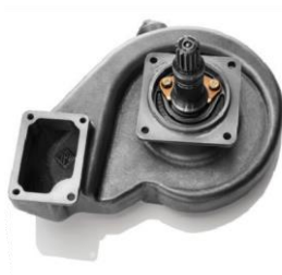
4160610 - Cat 3500 Water Pump