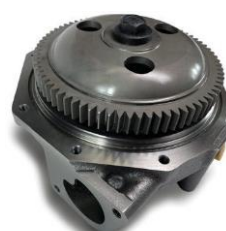
3520211 - C15 Water Pump