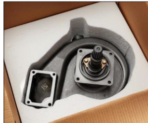
Custom foam inserts cushion pump for ultimate protection