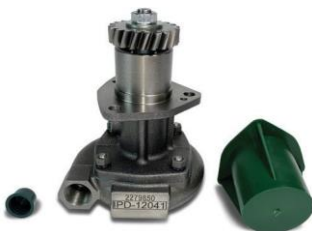
2279850 - G3300 Auxiliary Water Pump