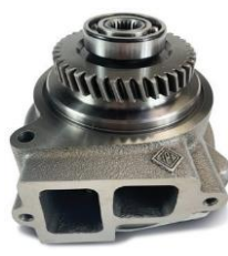
1727764 - G3304 and G3306 / Water Pump