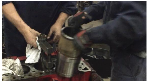
The engine begins to seize (top). The block held together and the cylinder liners did not crack due to the incredible strength of steel.

IPD ISX Steel Cylinder Liner Kit 4309389STL is an optional liner available in the following kits: