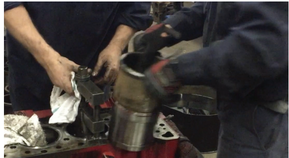
The engine begins to seize (top). The block held together and the cylinder liners did not crack due to the incredible strength of steel.

IPD ISX Steel Cylinder Liner Kit 4309389STL is an optional liner available in the following kits: