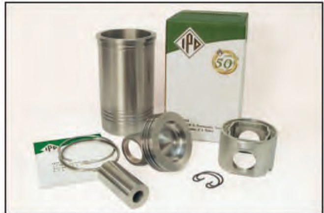
Available from IPD are popular options such as cylinder kits, in-frame and out-of-frame overhaul engine kits. (Shown with IPDSteel™ articulated piston)