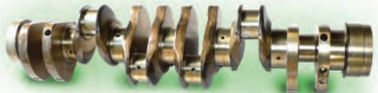
IPD offers a wide range of high quality forged steel crankshafts that receive multiple quality control checks for hardness, fillet radius specifications and straightness.