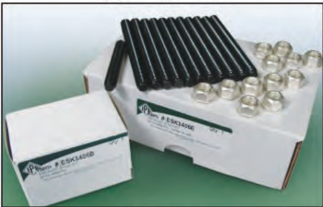
Exhaust manifold stud kits that include nuts and studs, packaged in convenient kits specific to 3406 engines (individual parts available for 3408 & 3412 applications).