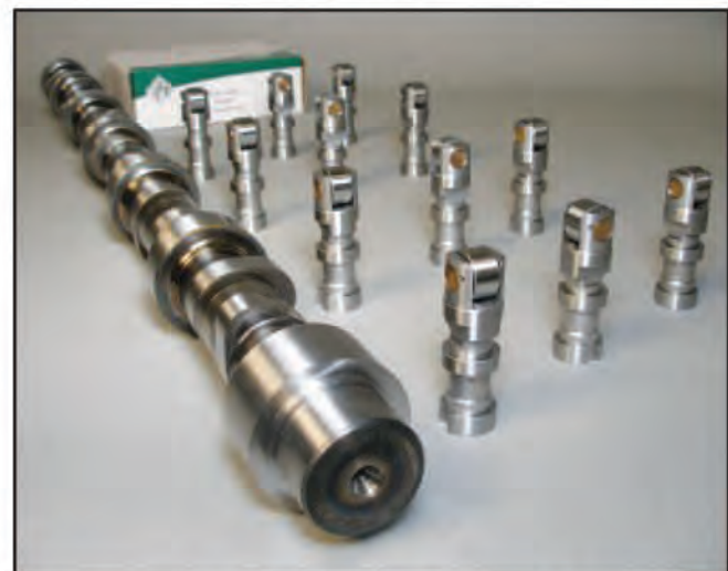
Camshafts and cam followers for popular applications. All held to the closest specifications and tolerances. More camshafts under development.

This is only a representation of our coverage, please contact your Customer Service Representative for further details. If you are an IPD Authorized Distributor, you can also access our on-line IPDNet™ parts cataloging and ordering system for up-to-date applications that are available from IPD.