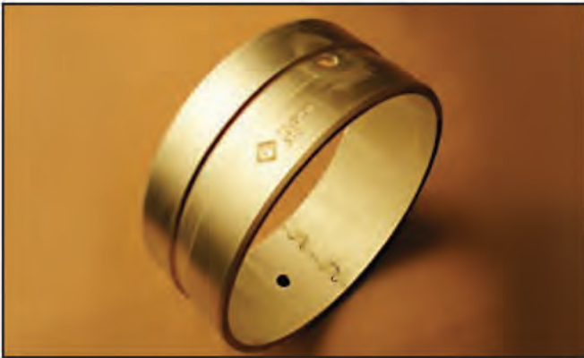
Camshaft and connecting rod bushings, including oversized camshaft bushings for popular applications.