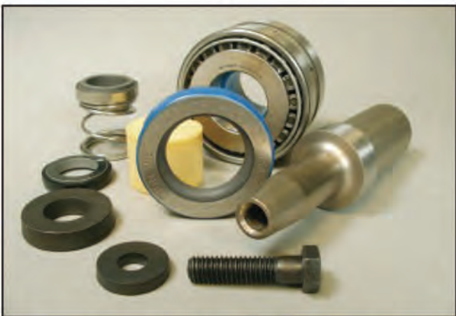
Water pump rebuild kits for popular applications.