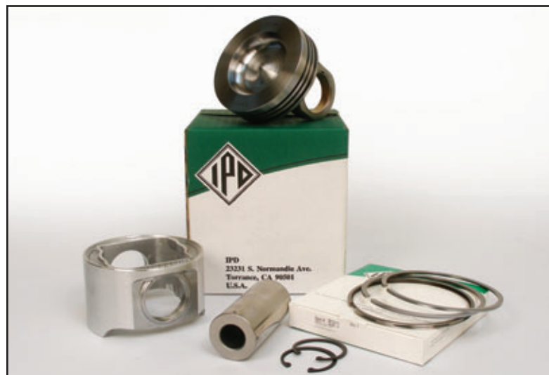
Shown above is a typical 3116 IPDSteel™ articulated piston kit from IPD

NEW IPDSteel™ ARTICULATED PISTON RELEASED FOR 3116 CATERPILLAR® MARINE AND TRUCK ENGINES.